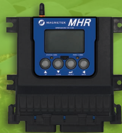
MHR RADIO CONTROLLER

Designed to simplify installations in the field, Magnetek receivers provide flexibility for easy adjustments or configurations. Combine a transmitter with one of our versatile receivers for a complete wireless control system. From traditional designs to our most sophisticated units, our portfolio of receivers offers total radio control.