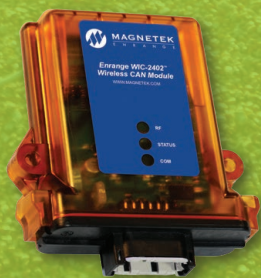
ENRANGE WIC-2402™ WIRELESS CAN MODULE