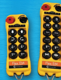
FLEX EM SERIES