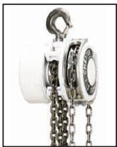
Zephyr Hand Hoist