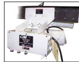
635 Motorized Trolley